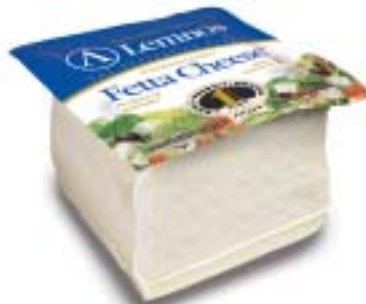
Fetta Cheese 1kg Regular