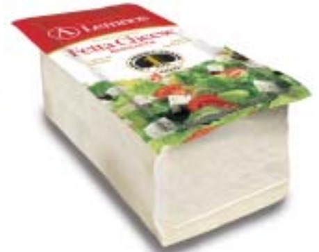
Fetta Cheese 1.8kg Reduced Fat