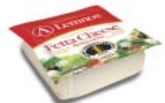
Fetta Cheese 500g Reduced Fat