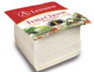
Fetta Cheese 1kg Reduced Fat