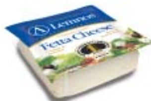
Fetta Cheese 500g Regular